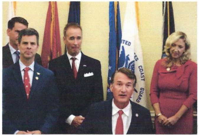
Virginia Gov. Ralph Northam (R) signs bills that alleviate taxes on military veteran pay at Quantico Corporate Center in Stafford County.

The region will soon be home to two new federal veterans' healthcare facilities. In Spotsylvania, The U.S. Department of Veterans Affairs is building a four-story, 450,000-square-foot clinic on a 48-acre at U.S. Route 1 at Hood Drive, opening next year.