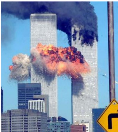
World Trade Center, NYC

The construction of One World Trade Center began in November 2006, and the building opened in November 2014. Numerous memorials have been constructed, including the National September 11 Memorial & Museum in New York City, the Pentagon Memorial in Arlington, and the Flight 93 National Memorial at the Pennsylvania crash site.