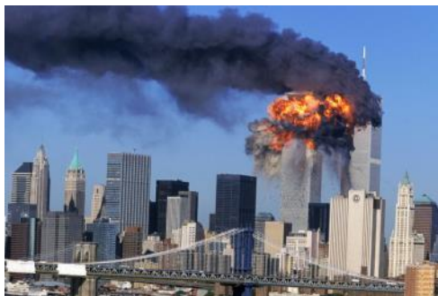
World Trade Centers, NYC

The destruction of the WTC and nearby infrastructure harmed the economy of New York City and created a global economic recession. The U.S. and Canadian civilian airspaces were closed until September 13, while Wall Street trading was closed until September 17. Many closings, evacuations, and cancellations followed, out of respect or fear of further attacks. Cleanup of the WTC site was completed in May 2002, and the Pentagon was repaired within a year. The attacks resulted in 2,977 fatalities, over 25,000 injuries , and substantial long-term health consequences (deaths of first responders/rescue workers have been attributed to long-term health effects from the pollution— burning jet fuel, plastics, metal, fiberglass, asbestos, etc.) in addition to at least $10 billion in