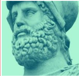
Mars, Roman God of War

"March" is named for the Roman god of war, Mars. This was the time of year to resume military campaigns that had been interrupted by winter. In the early Roman calendar, March (or Martius ) was the first month of the calendar year. As March brought the first day of spring with the vernal equinox, it was the start of new beginnings. March became the third month when January and February, which were added to the end of the Roman calendar around 700 BCE, instead became the first and second months around 450 BCE. In ancient Rome, March marked the start of the military campaign season. The Ides of March is a reference to the date Julius Caesar was stabbed to death in 44 BCE and is observed on the 15th day of the month.