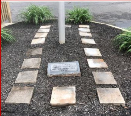
Front flag pole area