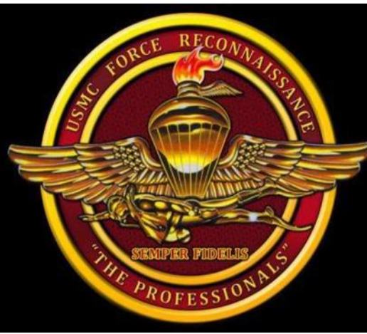
"Celer, Silens, Mortalis"