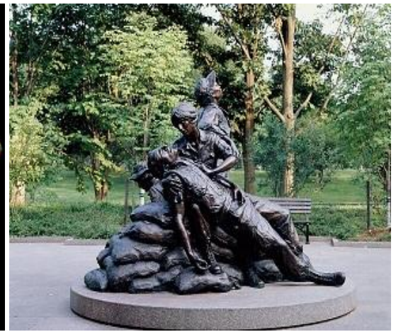
The Vietnam Women's Memorial to honor the women who risked their lives to serve their country. Depicting three women caring for a fallen soldier.