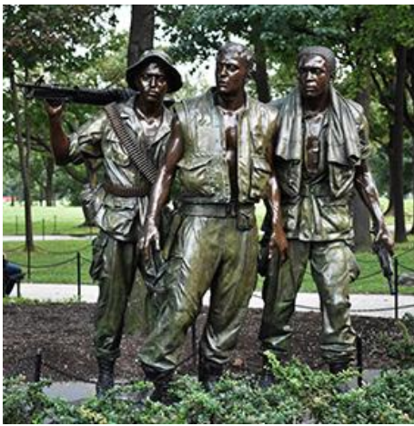
Three Servicemen Statue at the Vietnam Veterans Memorial