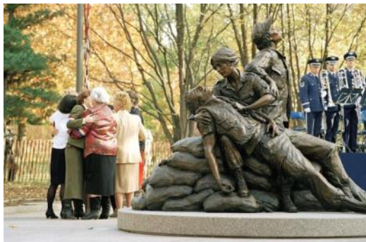
Dedication of Vietnam Women's Memorial, Washington, D.C.—11 NOV 1993